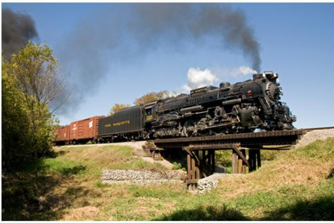
PERE MARQUETTE #1225